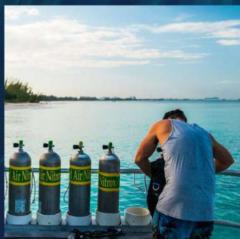
Enriched Air (Nitrox) Diver